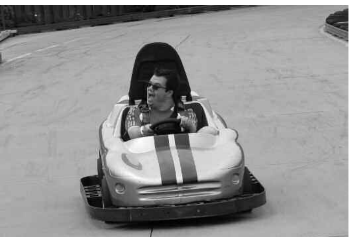
Camp High Hopes Field Trip at Wildwood Highlands