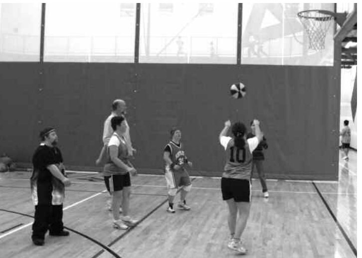
Y-Teens enjoying a game of basketball at the Baierl Family YMCA